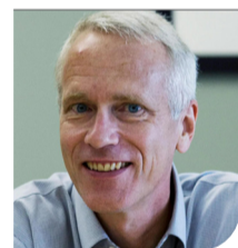
BRIAN KOBILKA Stanford University USA Nobel Prize in Chemistry 2012 Grimwade Award Lecturer