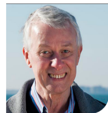
RICHARD J ROBERTS New England Biolabs USA Nobel Prize in Physiology or Medicine 1993 Special Plenary Lecture